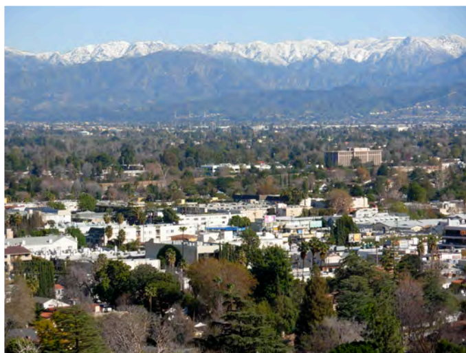
A San Fernando Valley Winter day, shot from a deck in Sherman Oaks.