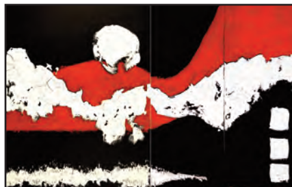
Tabachnick's acrylic Vermillion Evening .