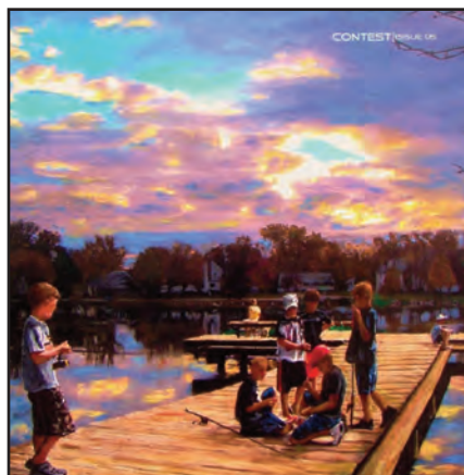
Sprout's acrylic Boys on the Dock .